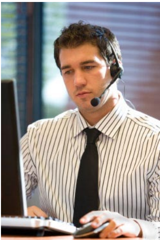
InstaVoIP Desktop can be used for Softphones or PC-based applications

InstaVoIP Desktop is an optimized library release for Windows and Linux, allowing for the rapid integration of voice calling features into new or existing applications without dealing with any porting or audio issues. Standalone SoftPhone application examples are provided, or the libraries can be integrated into existing applications.